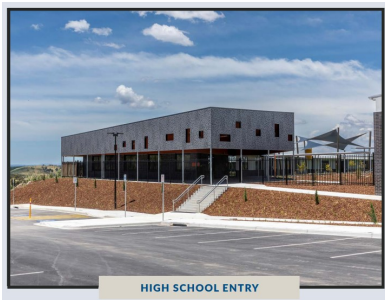
HIGH SCHOOL ENTRY